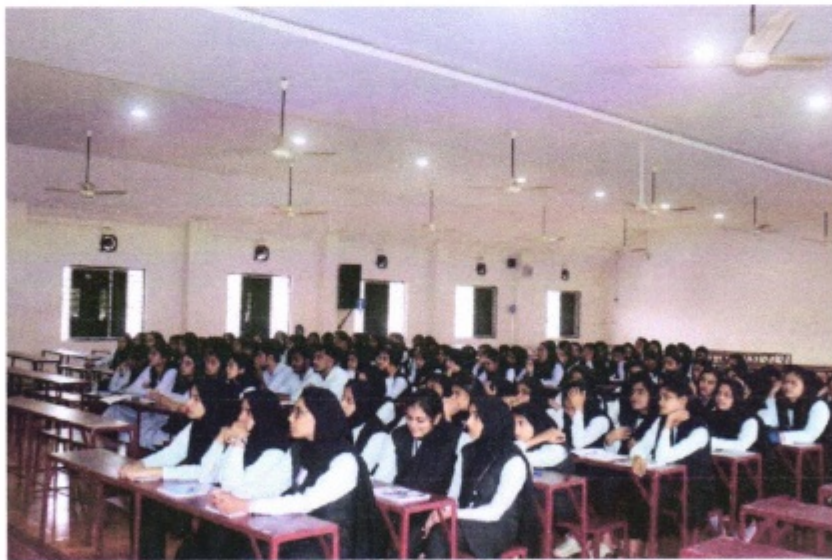
A glimpse of the Annual Debate Competition on 'The Role of Media in a Democratic Society,' organized by the Media Watch Club at Kottakkal Farook Arts and Science College