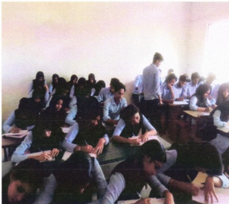
Students actively engage in the Media Literacy Workshop